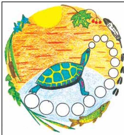
Karen Savage Blue