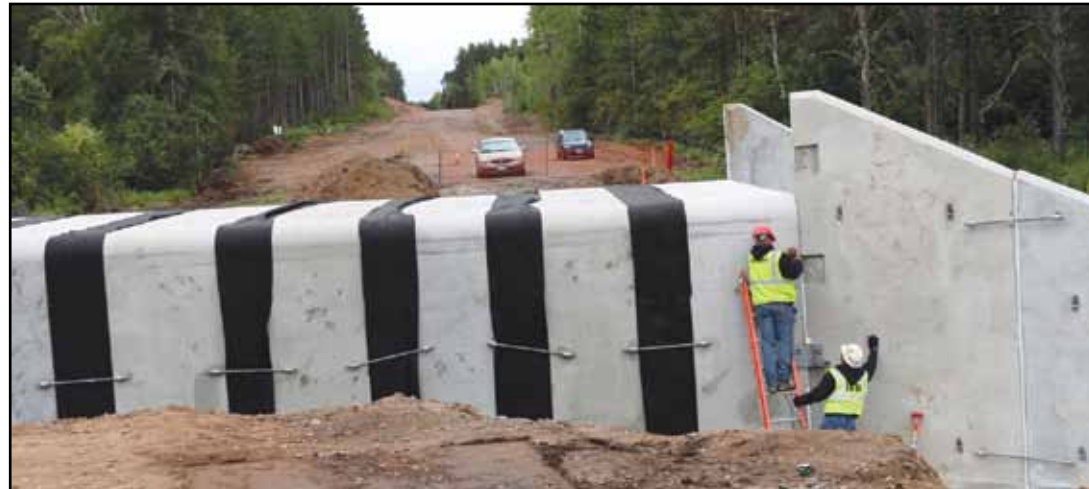
Construction crews work on the new square culvert on Cartwright Rd, just a few days after setting it into place.

The construction crews have been working on a number of different projects all summer, most notable the work on Cartwright and Airport roads. As the summer winds down they will be finishing work on those roads, only to continue with other projects next summer.