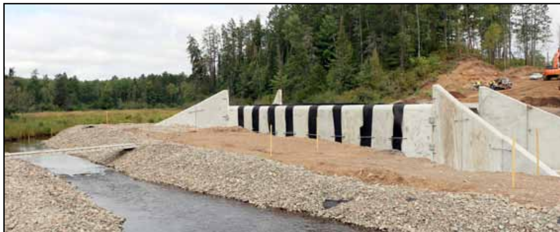
Otter Creek being diverted while the new culvert is placed during construction.

The next RBC open meeting will be November 20, 1:30 p.m. at CCC