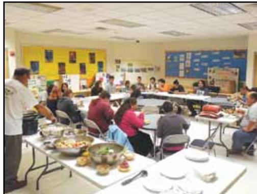
Journey Garden Closing feast