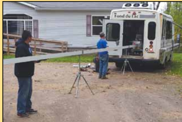
Fond du Lac crew members fabricating gutter on one of the properties Sept. 26

By the time the project is done, FDL employees will have replaced gutters and down spouts on over 600 FDL homes. Those 600 homes are homes owned or rented on the Reservations including homes owned and rented through the FDL's development corporation.