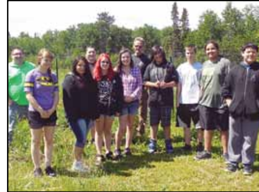
Students and staff on the first day of the Journey Garden program.