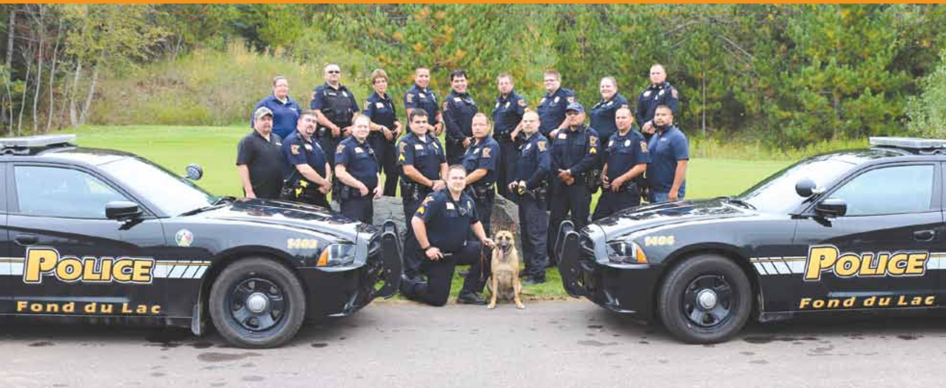
The FDL police department has been growing over the past several months, this group photo was taken just a day after 3 new officers were sworn into duty.