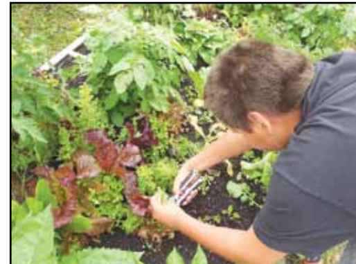
Harvesting the crops during the harvest week of the Journey Garden program