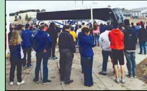
The send off to play at state

A aniin/Boozhoo Nindawemaganidok, It has been an exciting Biboon (winter) at the Fond du Lac Ojibwe School. I am extremely proud of our students and staff; they continually help each other to do the best they can in any situation. One of our mottos is Widookaadaading (we help each other). I also