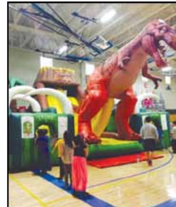
Doucette's bounce activities in the gym