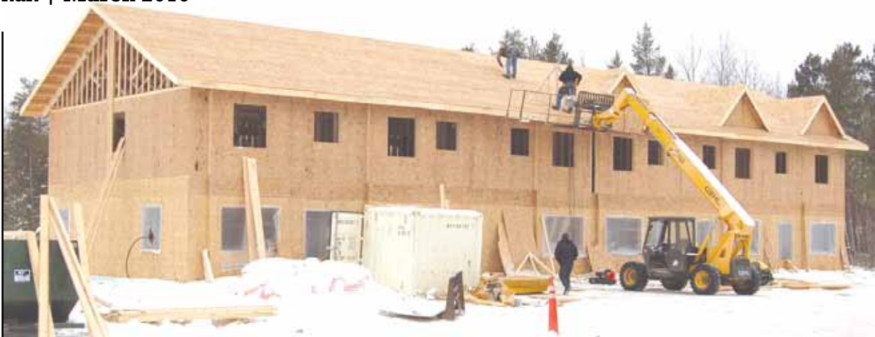
A building as part of the 24-unit supportive housing project.